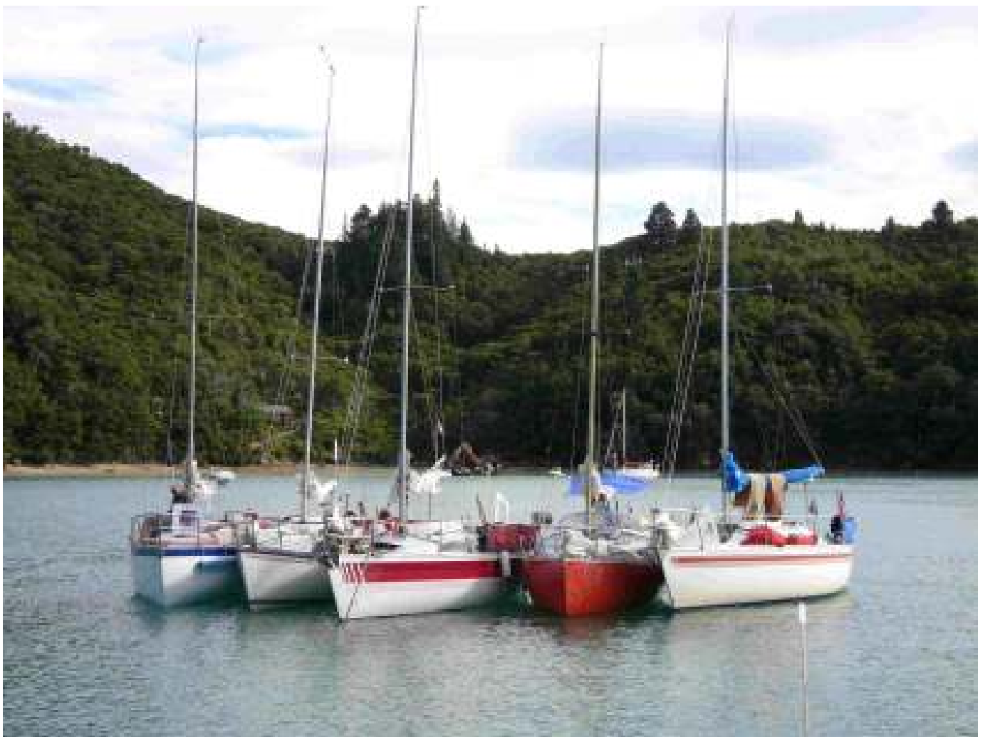
Evans Bay yachts (past & current) made their presence felt at St Omer over the Christmas break. L to R – Aquasition, some bloke from Christchurch someone from the club knows, Tarantula, Gauntlet IV, Honky Tonk. Conditions must have been good as they're all hanging off Tarantula's anchor...