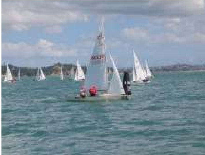
Nifty in action at the 2005 worlds, leading the way around the top mark